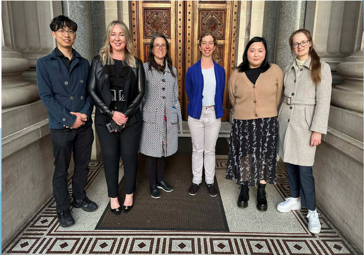
Photo of Democracy Developer's Board members and volunteers at Victorian Parliament House.